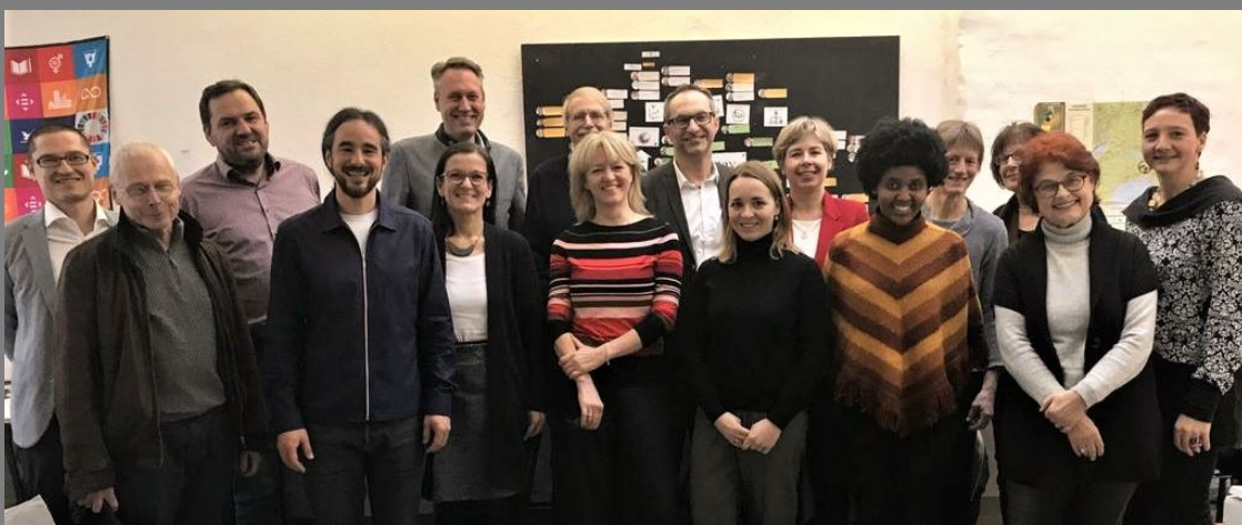
International Working Group of the Stiftungsnetzwerk Region Stuttgart e. V. (foundation network of the Stuttgart region, https://stuttgarter-stiftungen.de/ ), 21 January 2020.

2020 was a successful year for the consolidation of the Foundation's German–Latin American network with the aim of scholarly and cultural examination of past violence and autocratic systems. In the course of event planning and project support and development, trust with existing partners was deepened and further cooperation envisaged.