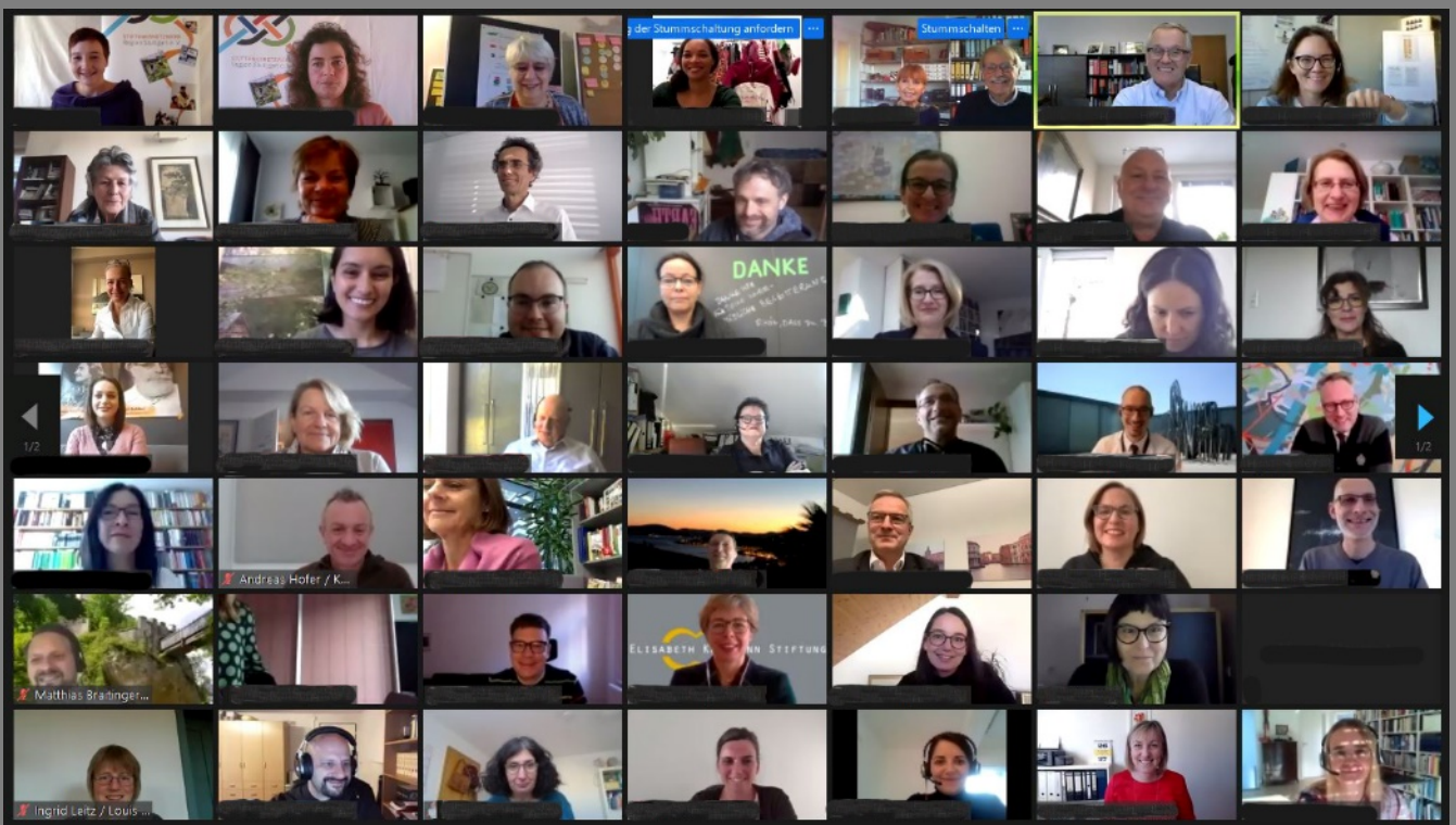
23rd Stuttgart Foundation Day, 27 November 2020