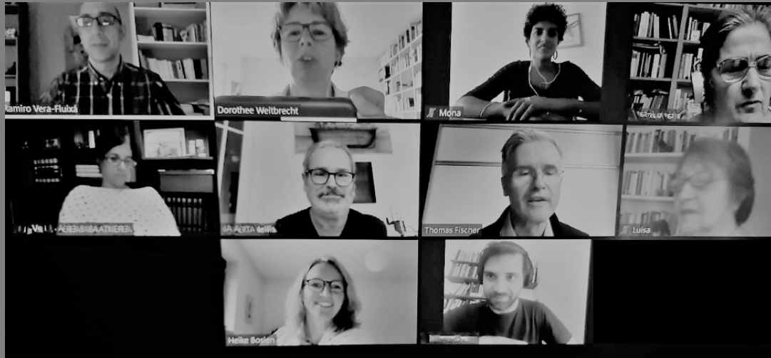
Zoom meeting with Memoria Abierta http://memoriaabierta.org.ar/wp/en/inicio/a in Buenos Aires, 19 June 2020

We exchanged views on the cooperation with South American partners with the Württemberg-based Hoffnungsträger Stiftung https://hoffnungstraeger.de/wer-sind-wir/ueber-uns/stiftung/ .